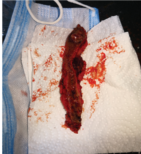
Minimally excised PNS track (original). PNS, pilonidal sinus.