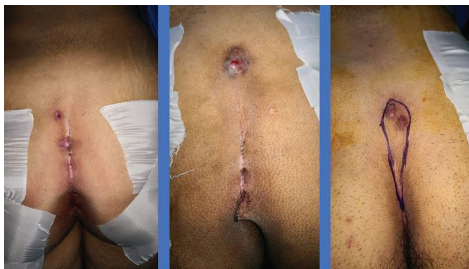
Varieties of PNS (original). PNS, pilonidal sinus.