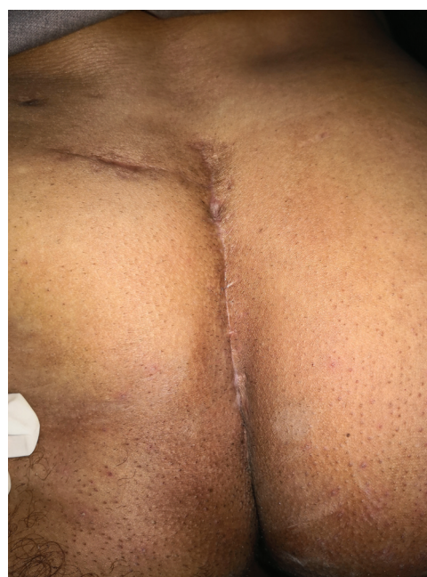
Healed wound with primary intention (original).