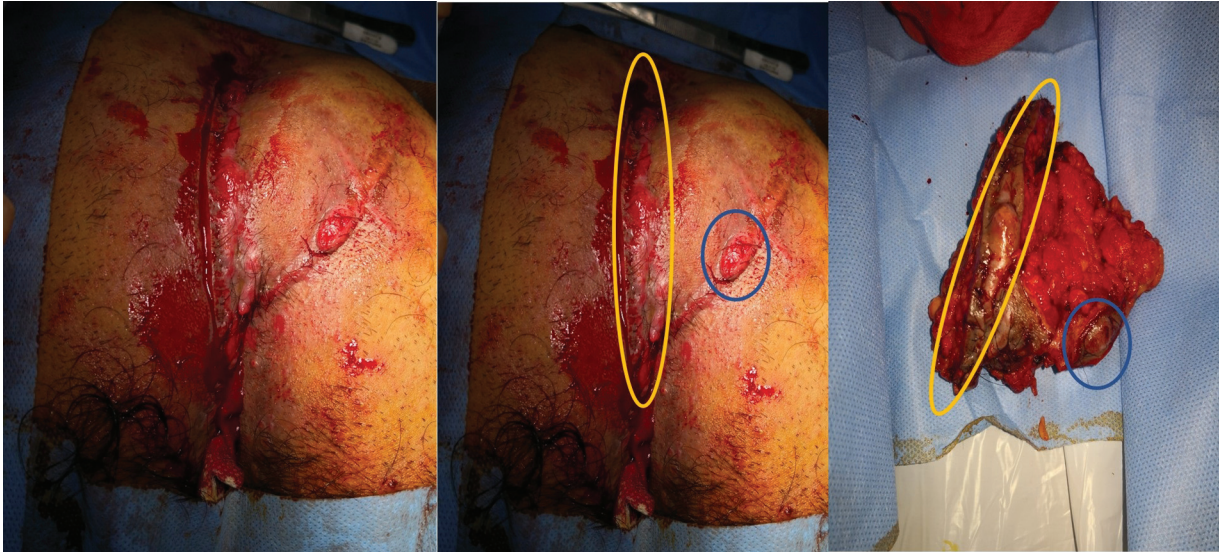
Recurrent PNS after rhomboid-flap reconstruction (original). PNS, pilonidal sinus.

In this study, the authors applied this concept from a different perspective. Plenty of cases along 9 years, configured refinement of the previously described technique [4].